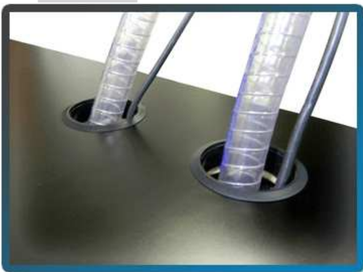
Pipe and cable management