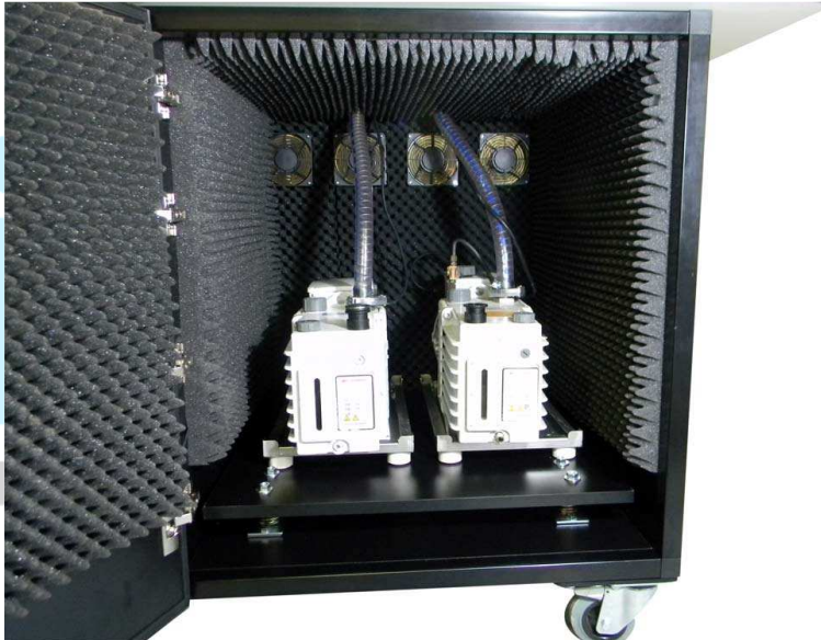
Noise enclosure for vacuum pumps