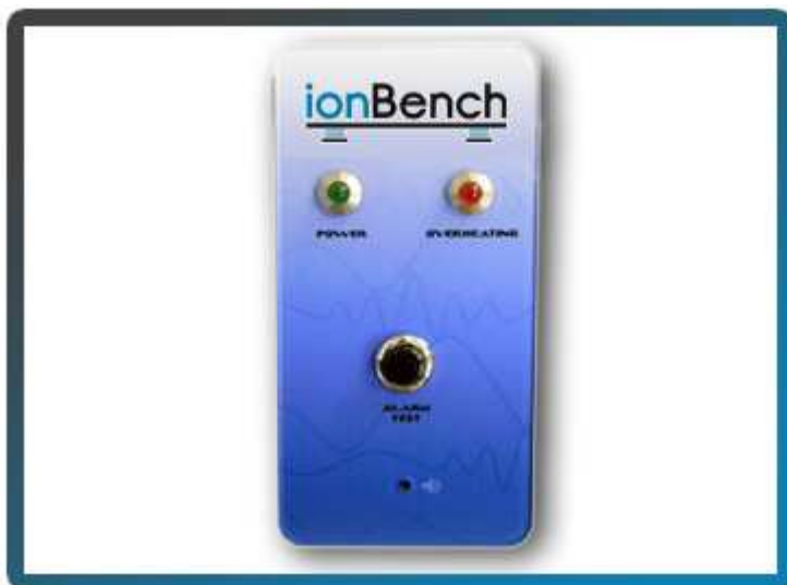
Overheating temperature alarm