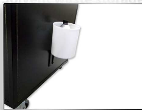
Solvent waste storage